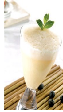
Vanilla Ice Cream Rave!

Essanté Organics 7.365 pH SHAKE is an outrageously delicious & nutritious meal replacement shake that makes it easy to alkalize, energize & metabolize! 7.365 pH SHAKE targets and incinerates fat faster while amplifying your energy & balancing your pH levels! How? It's easy because with 7.365 pH SHAKE you'll ENJOY ALL OF THE GREAT ingredients & AVOID ALL OF THE BAD ones. One of the reasons we gain weight is when we consume toxins, our body protects us by creating fat cells and storing those toxins within. Essante' Organics 7.365 pH SHAKE is 100% chemical free AND has all the nutrition & the perfect pH balance your body needs to be healthy. Our 7.365 pH SHAKE uses a groundbreaking high-quality vegan protein formulation proven to facilitate weight loss in 3 ways: ALKALIZE, ENERGIZE & METABOLIZE "7.365" 7 days a week, 365 days a year!